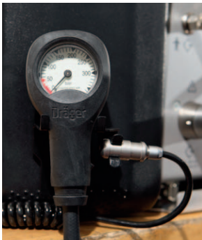
Rest position for pressure gauges and microphone