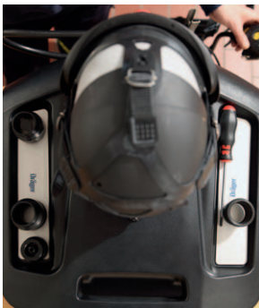
Perfect seal for different mask sizes